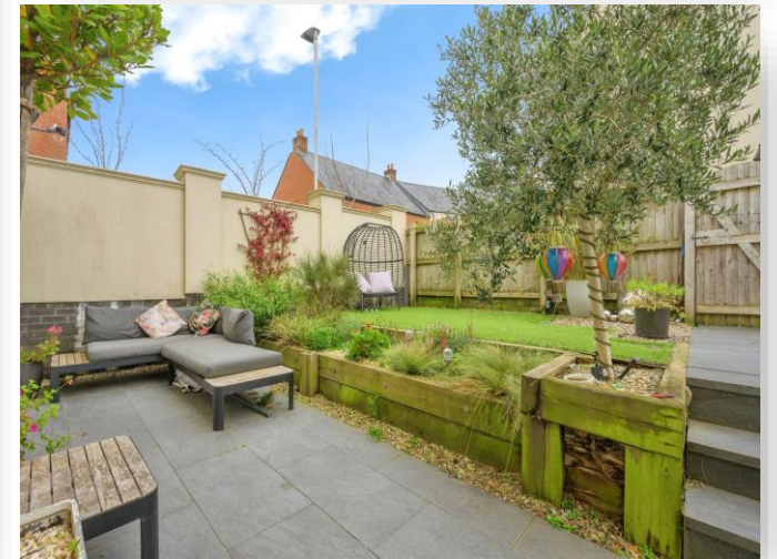
Aries Lane, Sherford Plymouth PL9 8FD