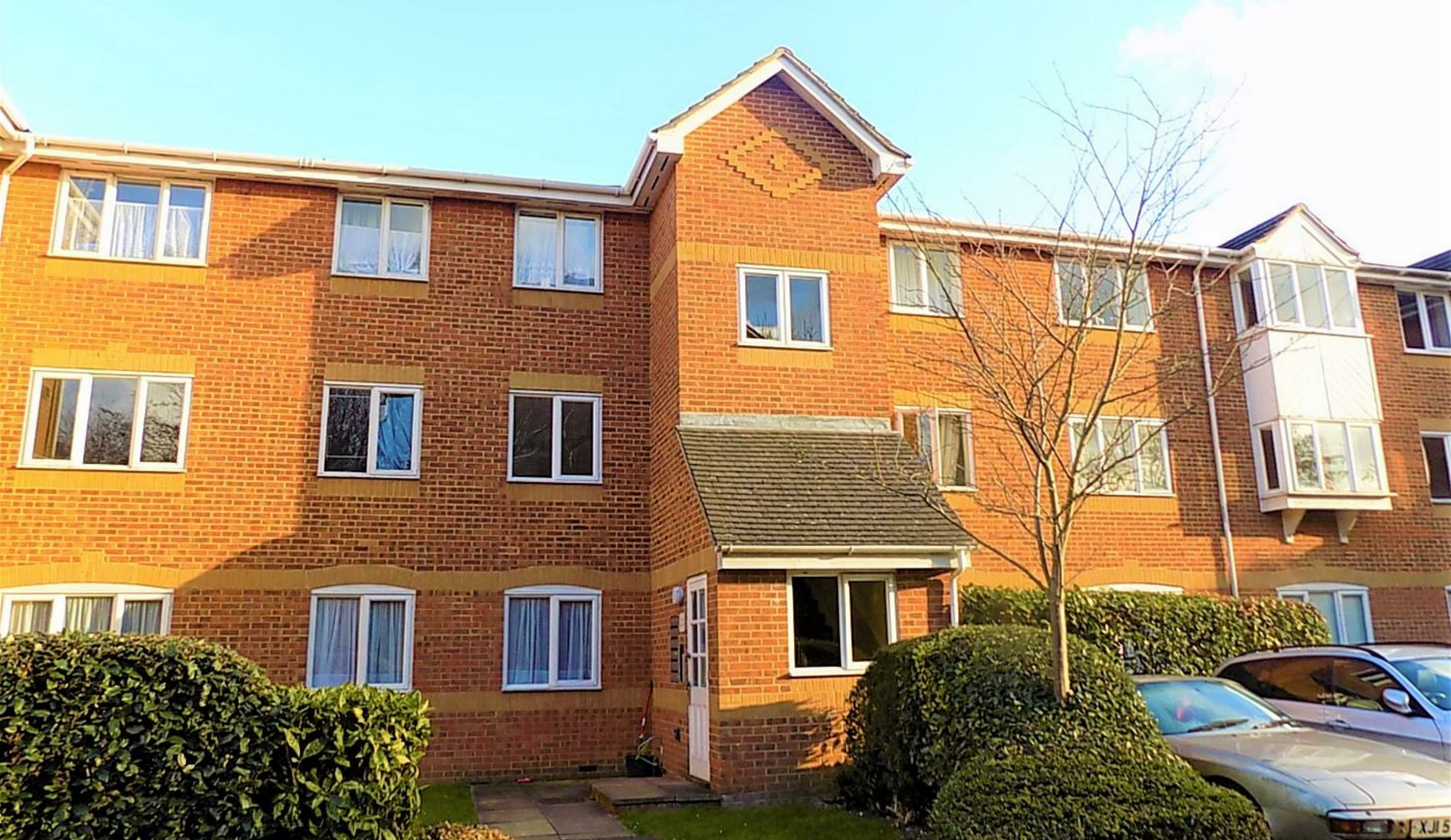
Ascot Court, Aldershot