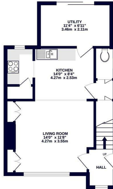
GROUND FLOOR 424 sq.ft. (39.4 sq.m.) approx.