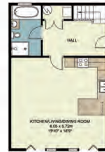
ANNEXE GROUND FLOOR