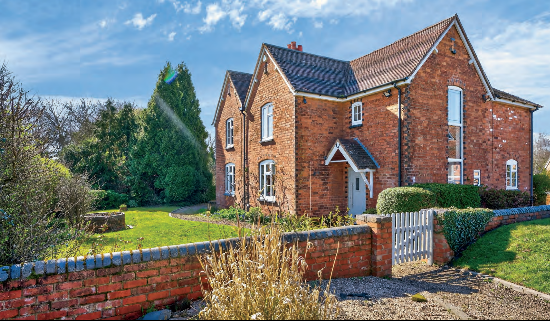
Hill Farm Cottage Doverdale | Droitwich | Worcestershire | WR9 0QA