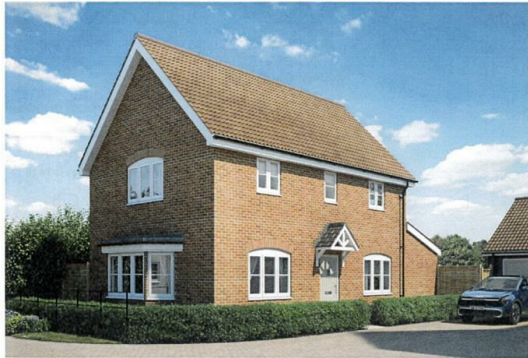
All images are for illustrative purposes only and details may be subject to change.

THREE BEDROOM DETACHED HOME HOMES | PLOT 7