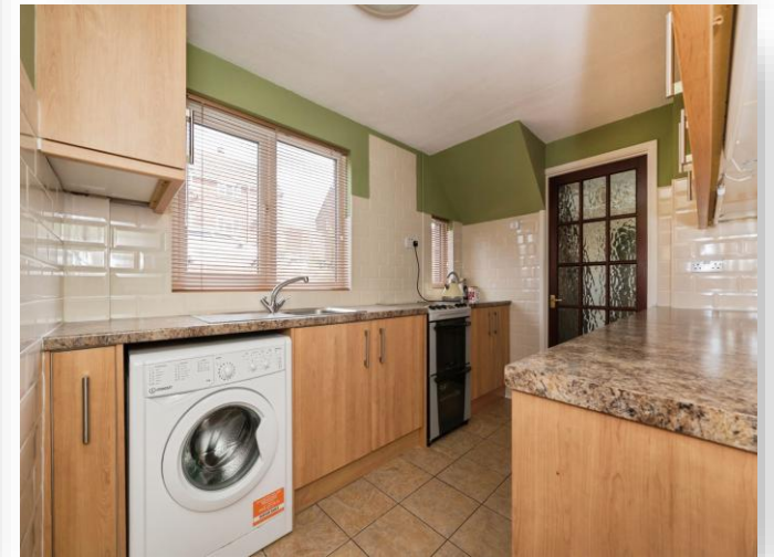
Cotton Close, Bishopstoke, EASTLEIGH, SO50 6FY