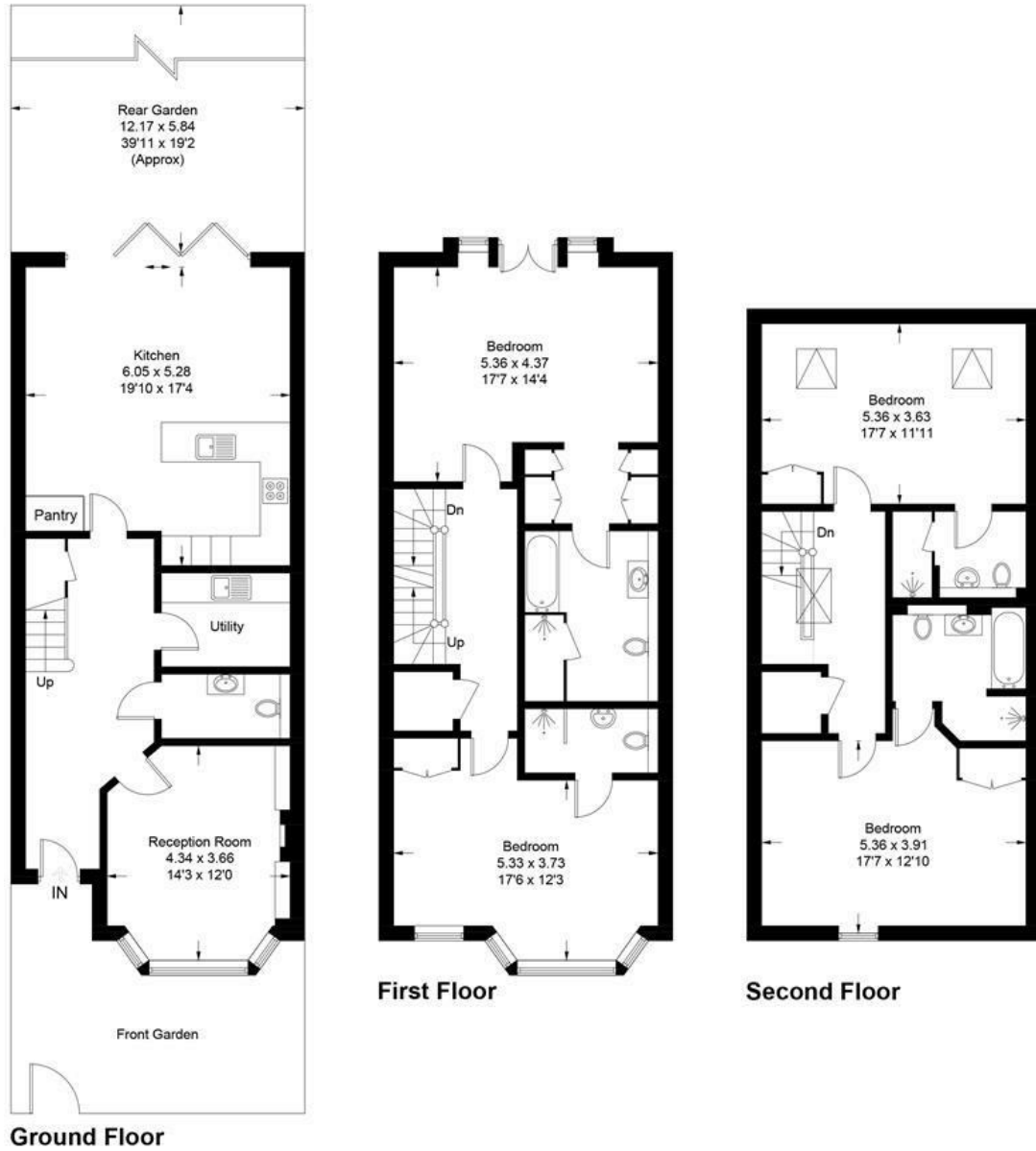
Illustration for identification purposes only, measurements are approximate, not to scale. (ID1287846)