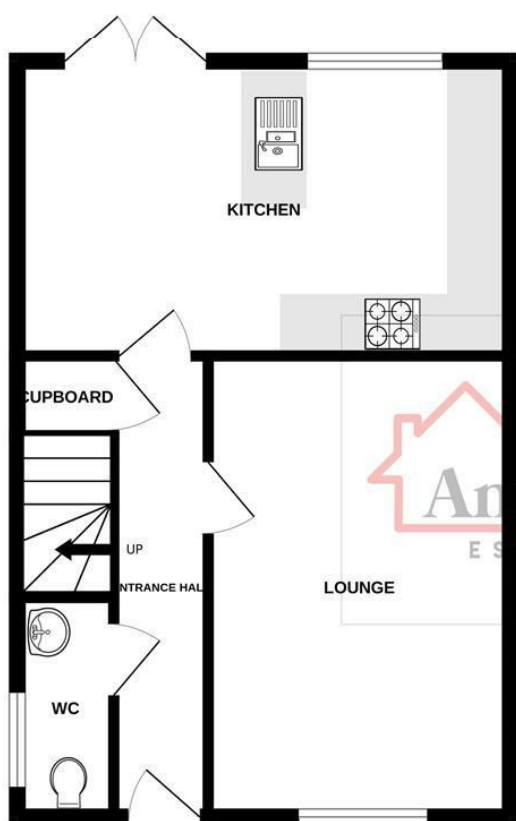
GROUND FLOOR 455 sq.ft. (42.3 sq.m.) approx.