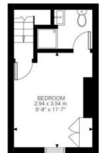
First Floor 164 ft 2

Glycena Road, SW11 Approximate Gross Internal Area 79.34 SQ.M / 854 SQ.FT