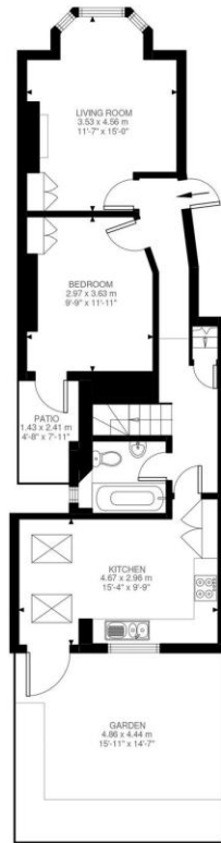
Ground Floor 584 ft 2