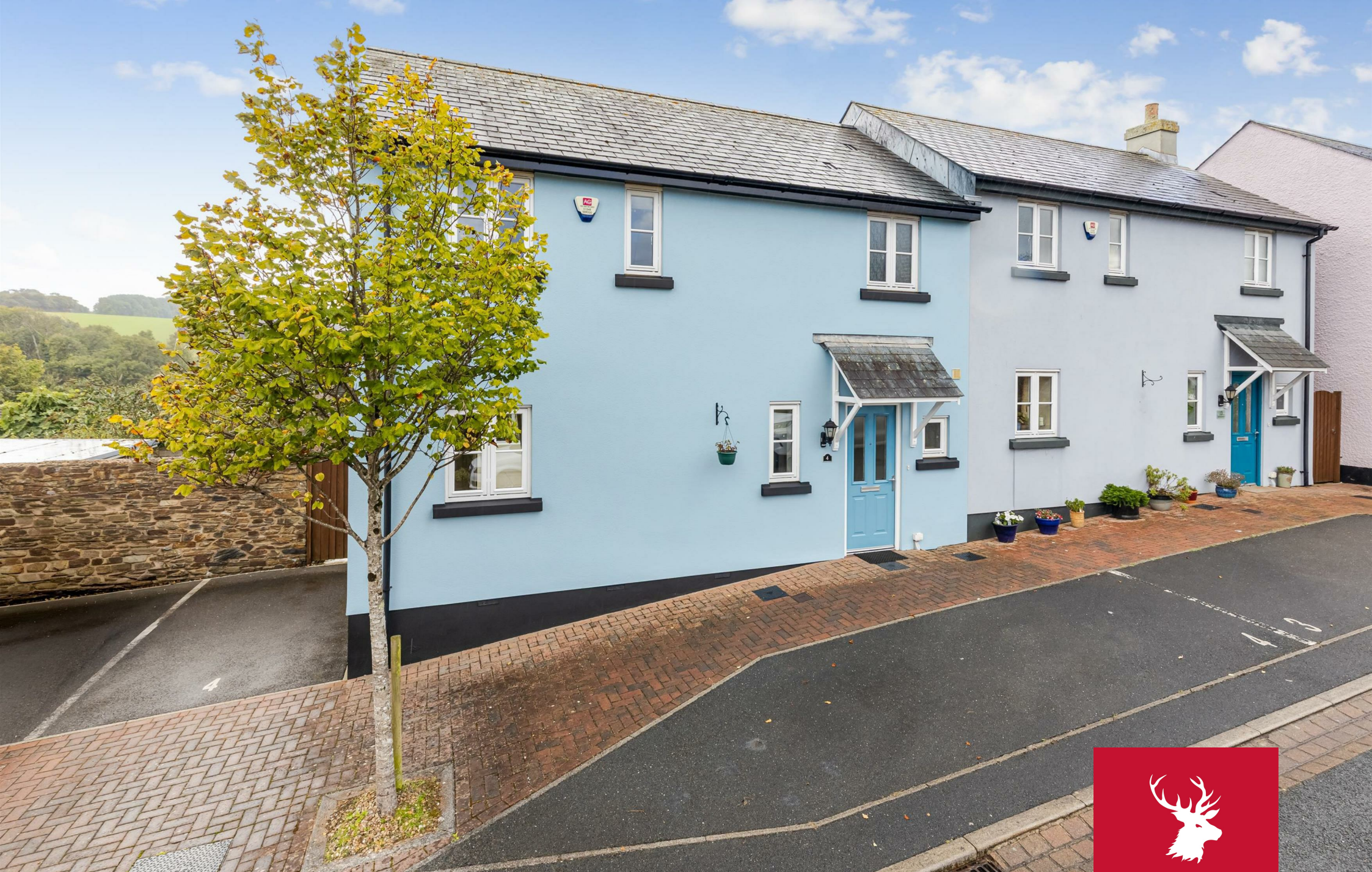
4, Helmers Way