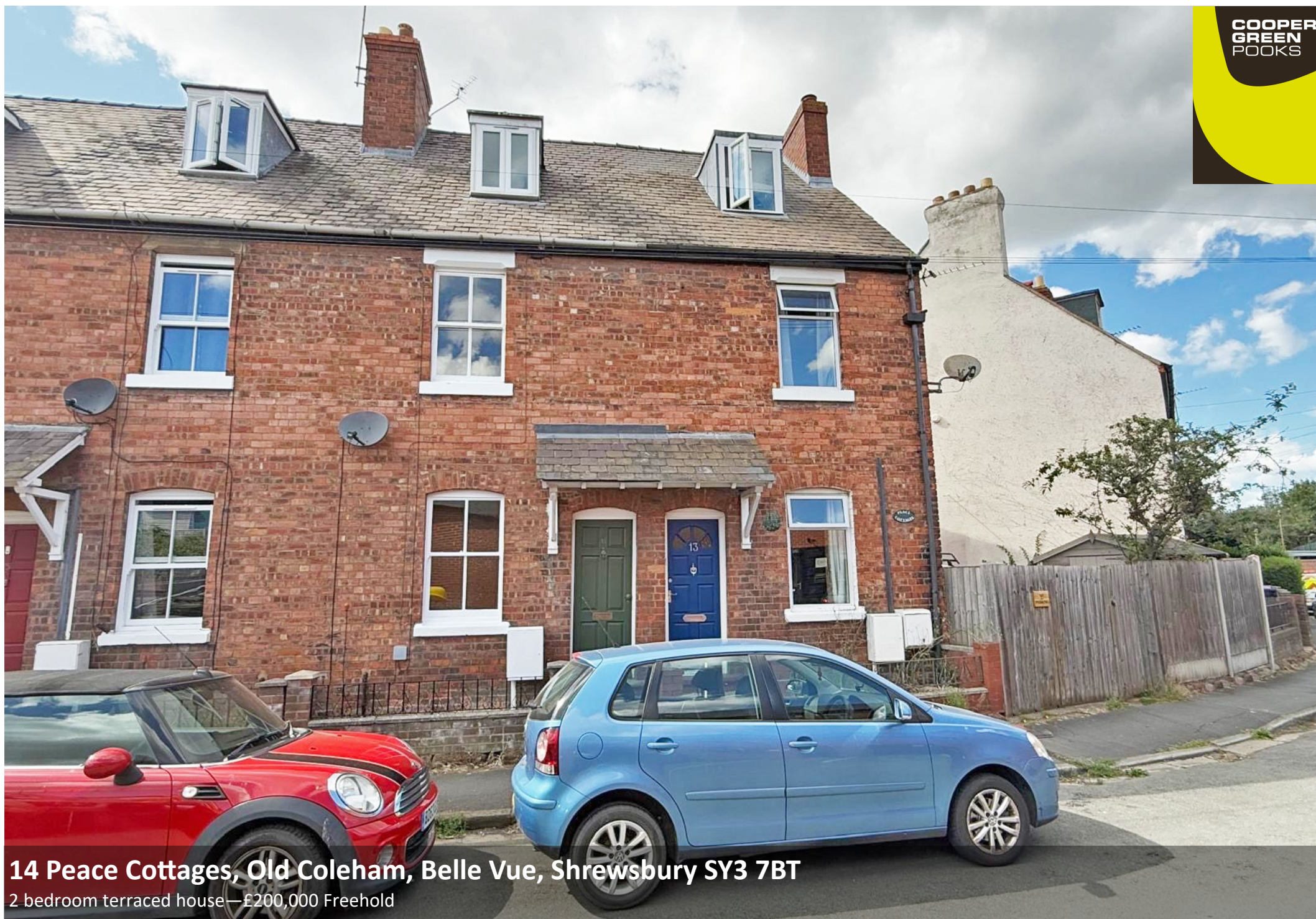
14 Peace Cottages, Old Coleham, Belle Vue, Shrewsbury SY3 7BT

2 bedroom terraced house—£200,000 Freehold