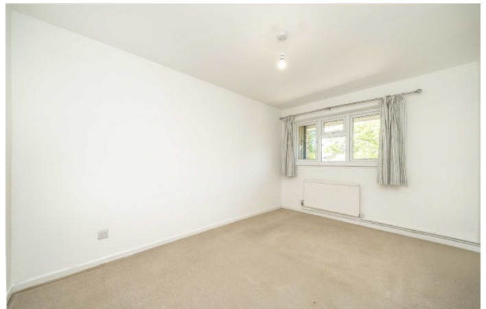
Hammond Close, TW12