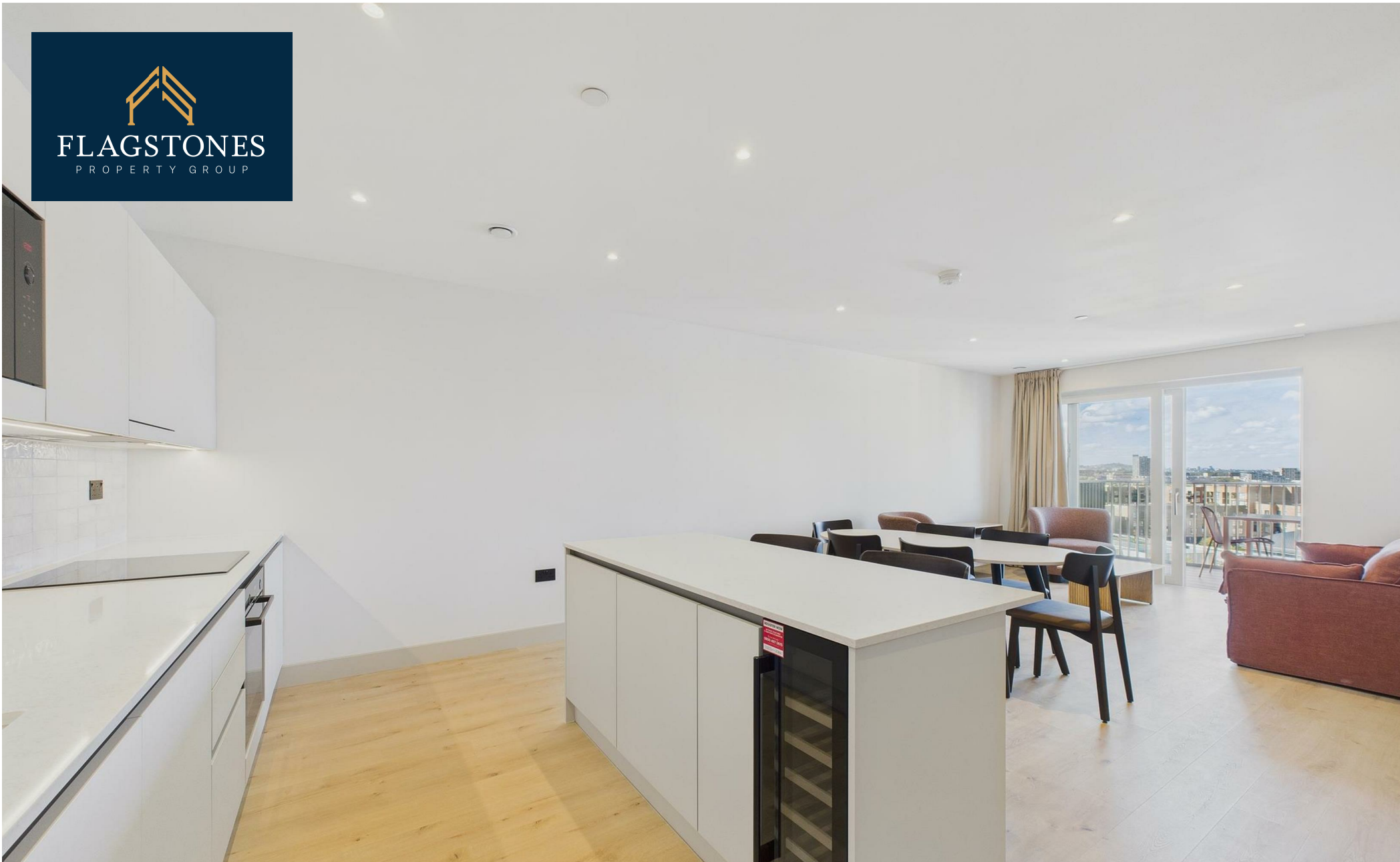
5464 Delfino House, Caversham Road, Colindale, NW9 5QF £3,340 Per month