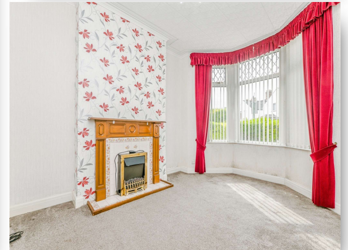
Moorland Road, Splott Cardiff CF24 2LG