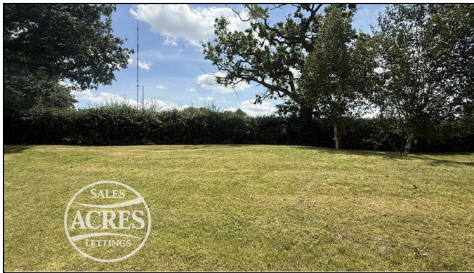
Flat 7, 40 Wyndley Close, Four Oaks