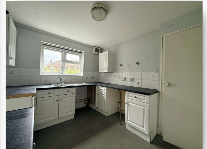
Parnel Road, Ware SG12 7LE