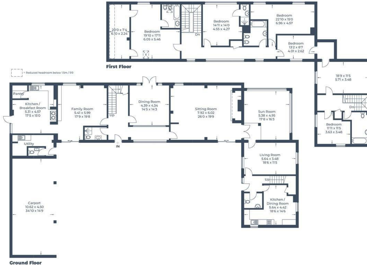
Illustration for identification purposes only, measurements are approximate, not to scale. © CJ Property Marketing Produced for Fine & Country