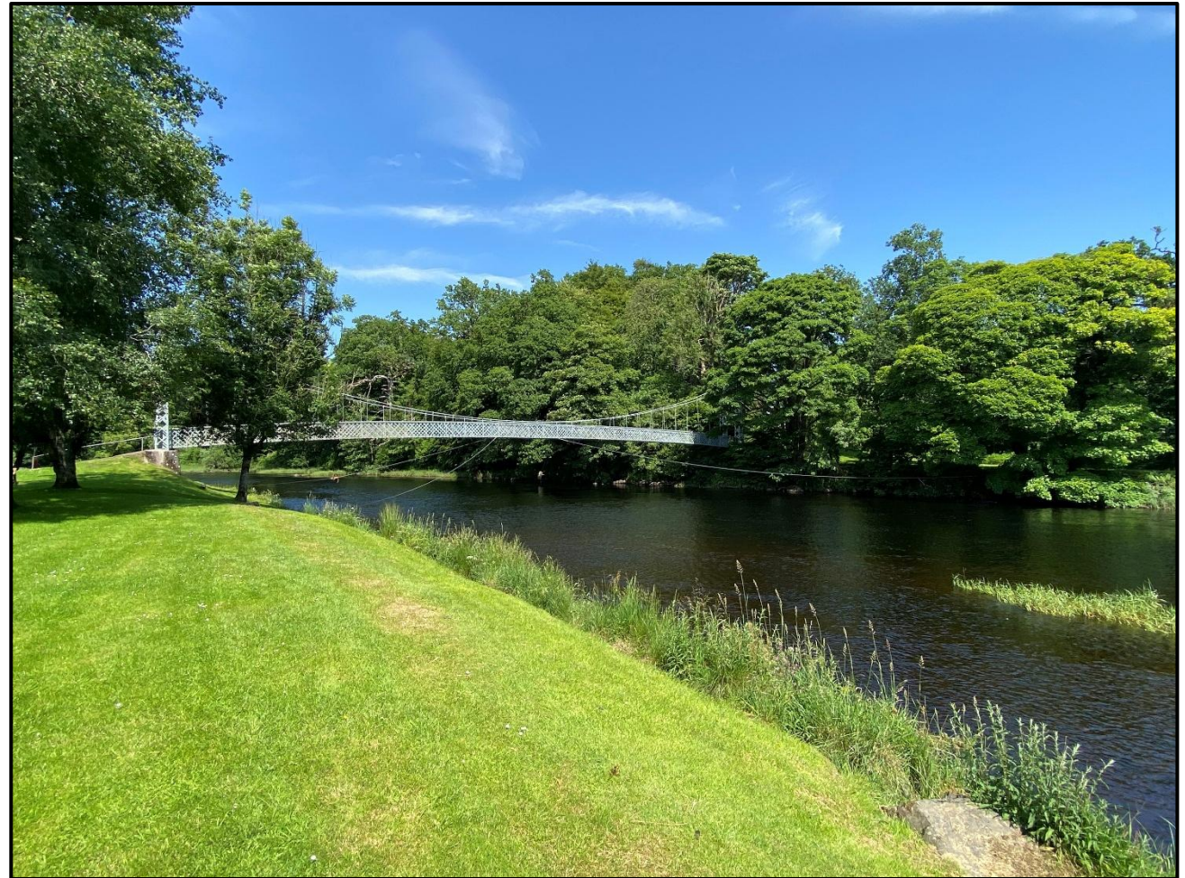
Suspension Bridge connecting Newton Stewart & Minnigaff

Minnigaff benefits from local facilities including a primary school, while a wider range of shops, services, and leisure options can be found just across the river in Newton Stewart. With its scenic surroundings and relaxed pace of life, Minnigaff is an attractive location for those seeking a countryside lifestyle within reach of everyday conveniences.