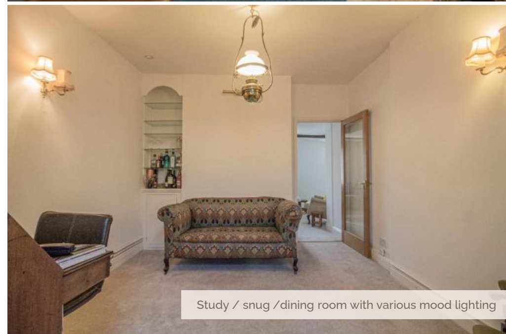
Study / snug / dining room with various mood lighting