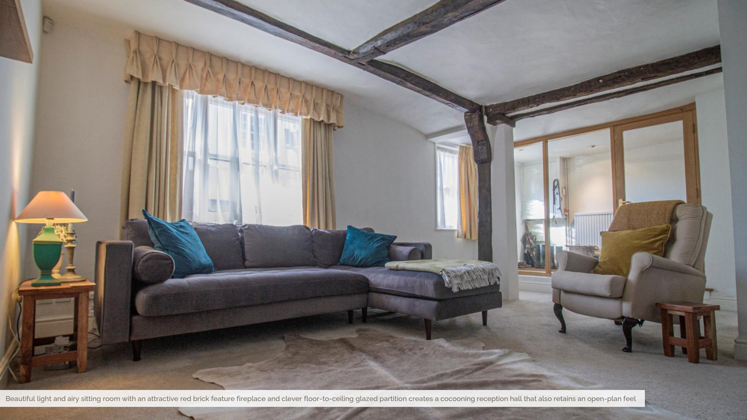
Beautiful light and airy sitting room with an attractive red brick feature fireplace and clever floor-to-ceiling glazed partition creates a cocooning reception hall that also retains an open-plan feel