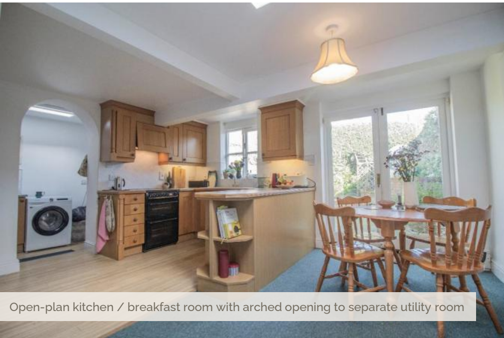
Open-plan kitchen / breakfast room with arched opening to separate utility room