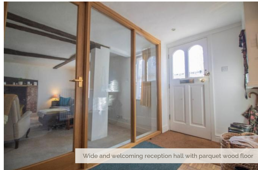
Wide and welcoming reception hall with parquet wood floor

A glazed door opens into a large Sitting Room with various period elements taking centre stage, which include an attractive red brick feature fireplace with oak bressummer and brick hearth, exposed ceiling beams and a wide sash window to front aspect in addition to another. Three table lamp points TV and phone points. Radiator. Full-height glazed door to: