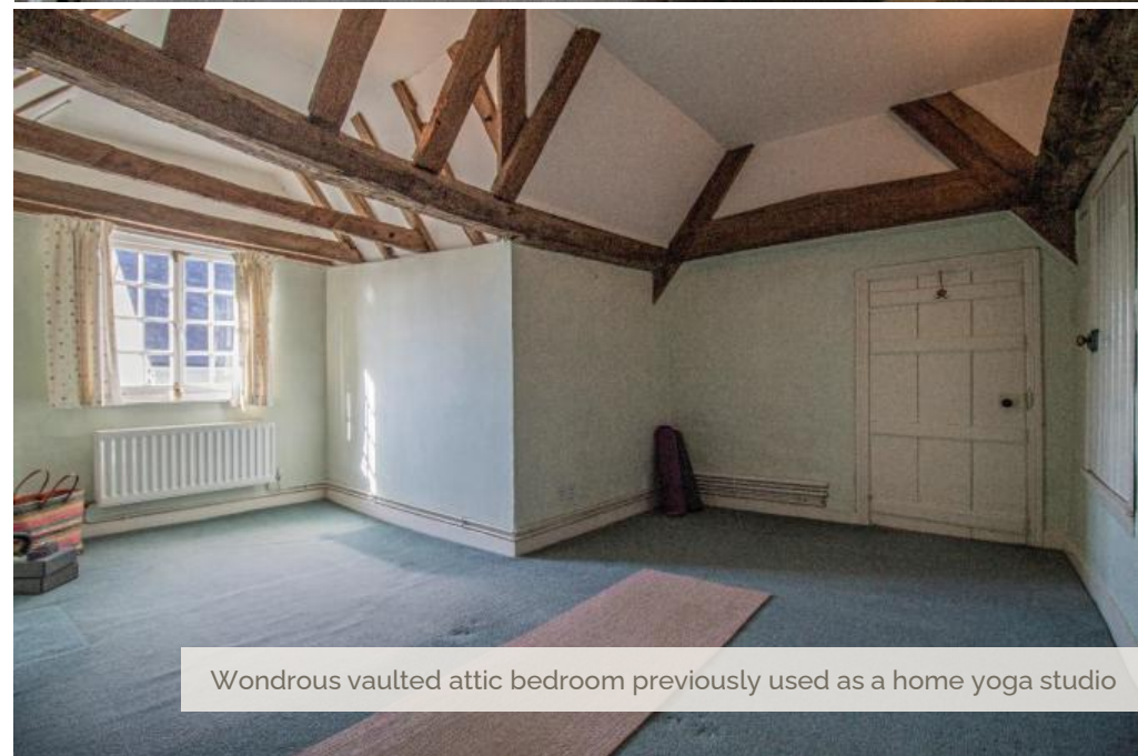
Wondrous vaulted attic bedroom previously used as a home yoga studio