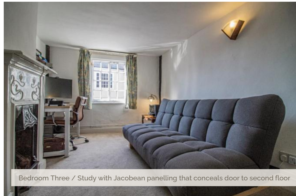
Bedroom Three / Study with Jacobean panelling that conceals door to second floor

Suite comprises: corner panelled bath tub with shower attachment, vanity unit with inset basin, wc. Extractor fan. Shaver point. Partially tiled and with newly laid vinyl floor. Recessed ceiling light. Heated towel rail.