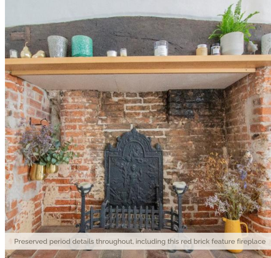
Preserved period details throughout, including this red brick feature fireplace

From the town centre (on foot) leave the Market Square with Nutshell pub behind you, proceed down Whiting Street, crossing Churchgate Street towards Westgate Street and No.32 is 75 metres along the street on the left hand side.