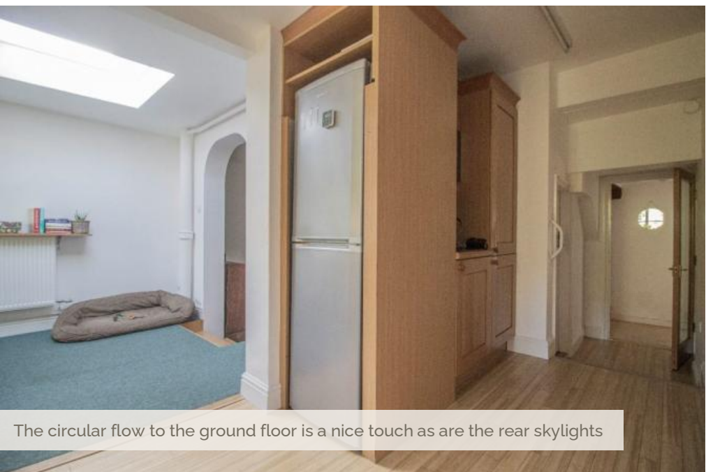
The circular flow to the ground floor is a nice touch as are the rear skylights