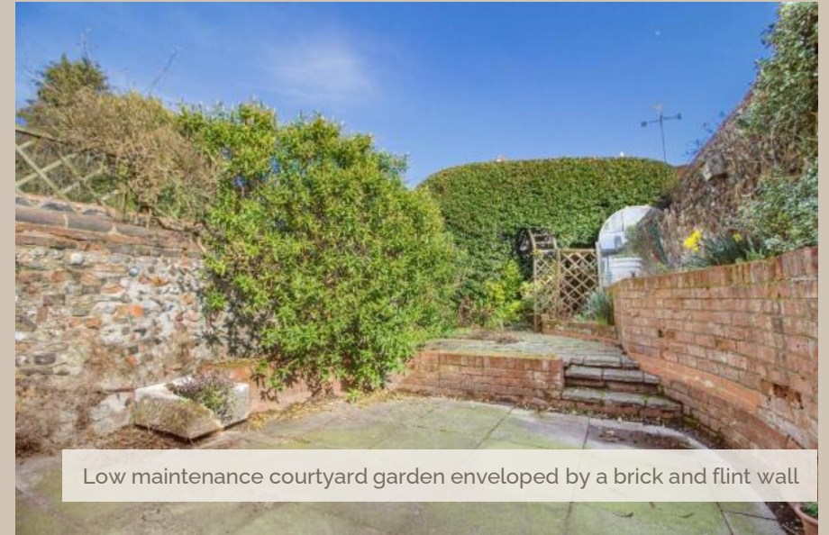
Low maintenance courtyard garden enveloped by a brick and flint wall

There is a wide choice of excellent schooling, both Private and State, within the area. Private includes: Culford School (1-19); South Lee School (2-13). State includes: Guildhall Feoffment Primary School (5-11); King Edward VI School (11-18). University of Suffolk at West Suffolk College - Further Education.