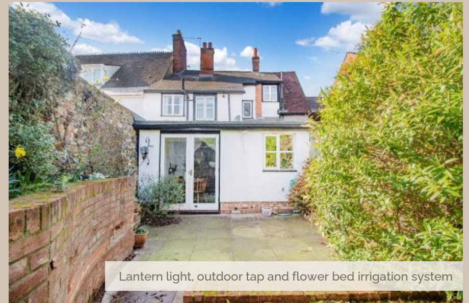
Lantern light, outdoor tap and flower bed irrigation system