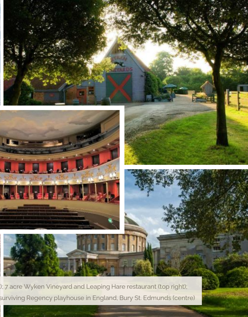
Nearby amenities: red heather in Cavenham Heath Nature Reserve (left); 7 acre Wyken Vineyard and Leaping Hare restaurant (top right); majestic National Trust Ickworth House and Park (bottom right); oldest surviving Regency playhouse in England, Bury St. Edmunds (centre)