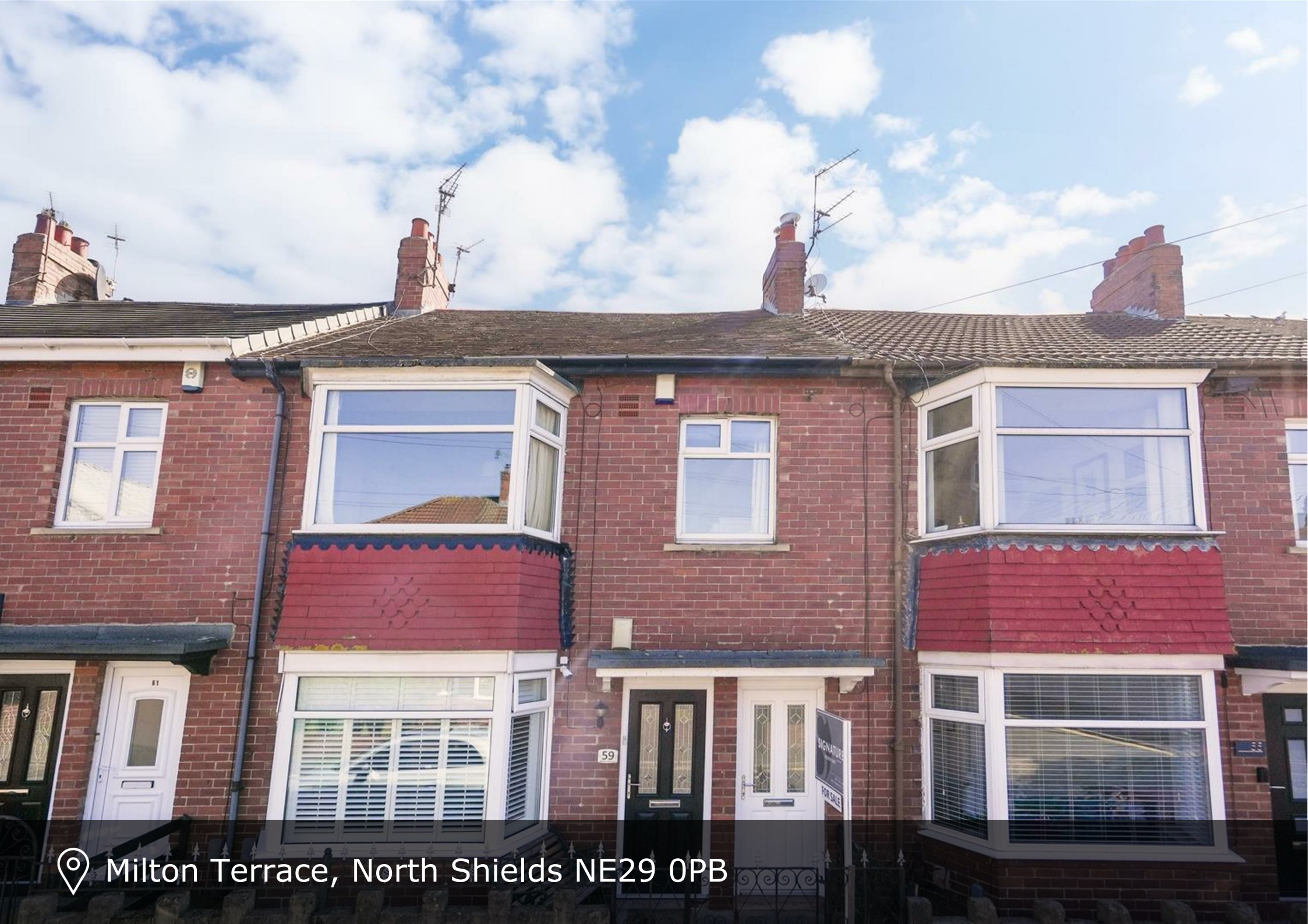
📍 Milton Terrace, North Shields NE29 0PB