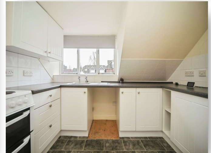
Gipping Place, Stowmarket IP14 1JW