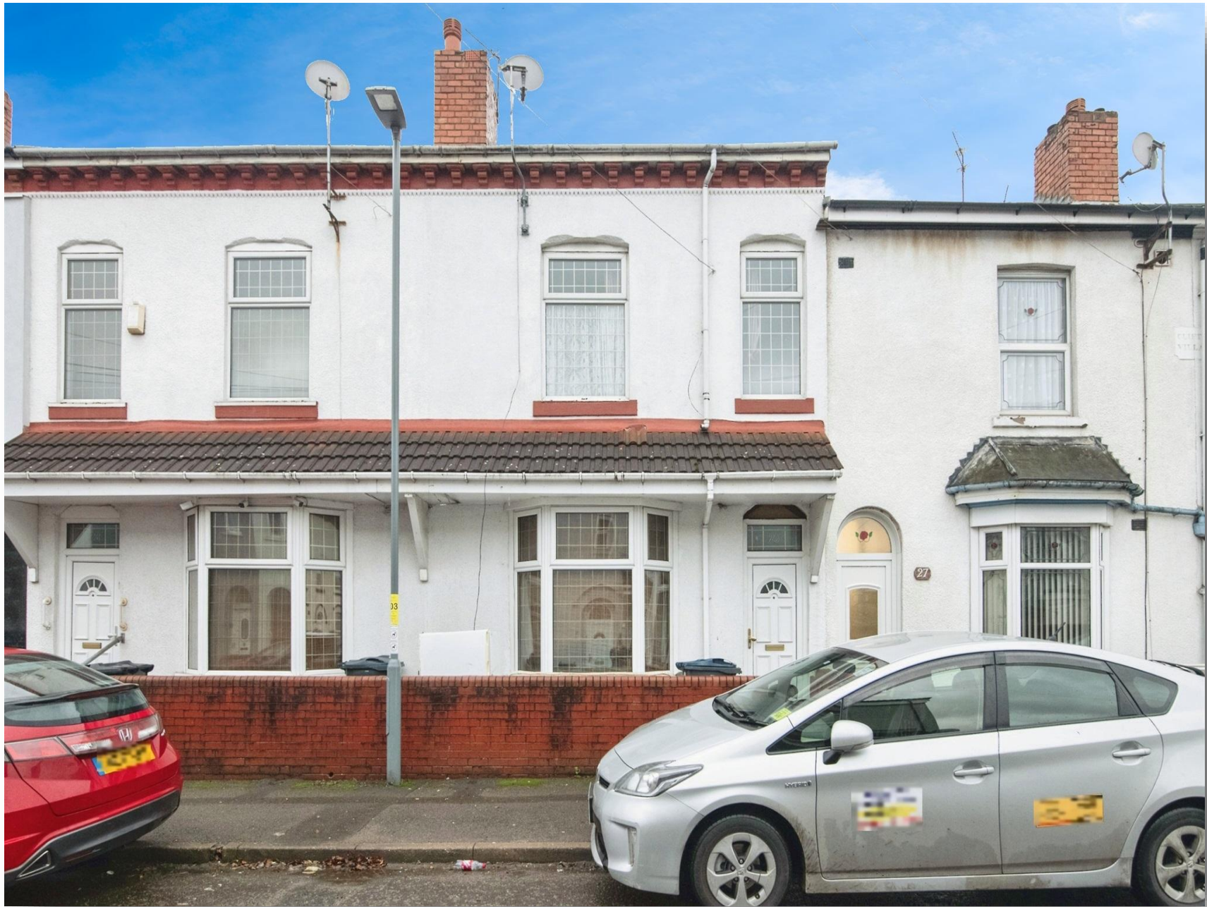
Wilson Road, Lozells Birmingham B19 1LY