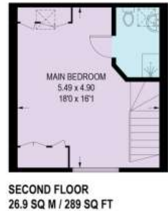
Illustration is for identification purposes only, measurements are approximate, not to scale.