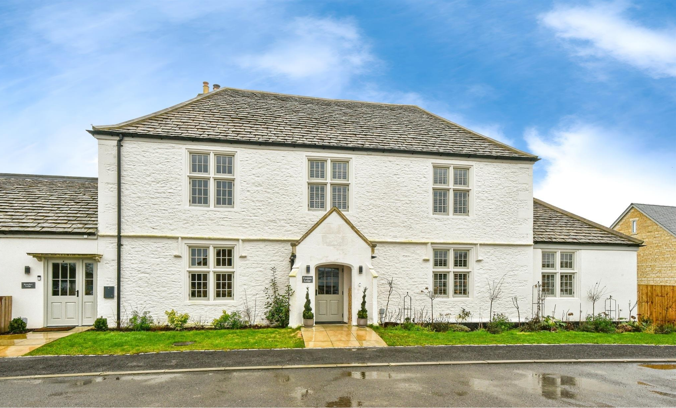
Mermaid Court, Christian Malford Chippenham SN15 4FS