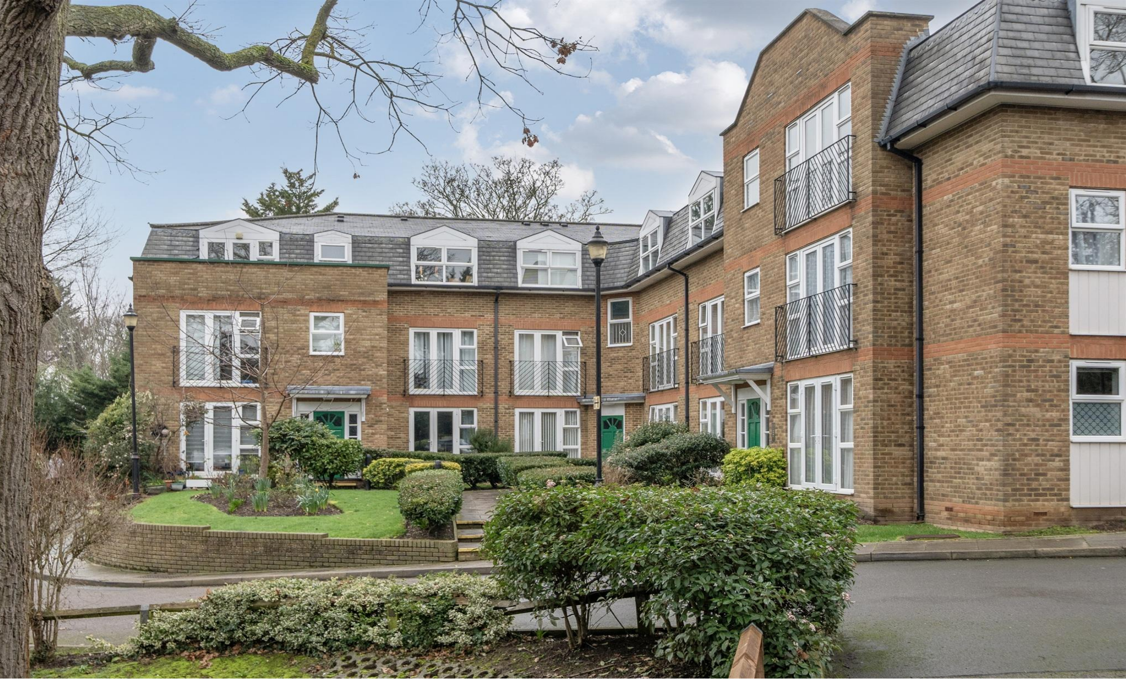
Foxwood Green Close, Enfield, EN1 2TB