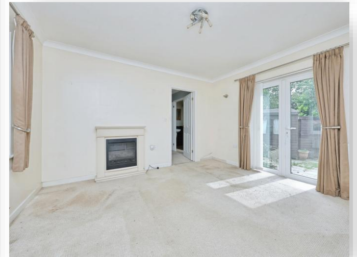
Thatch View, Ranworth Road, Blofield, Norwich, NR13 4PJ