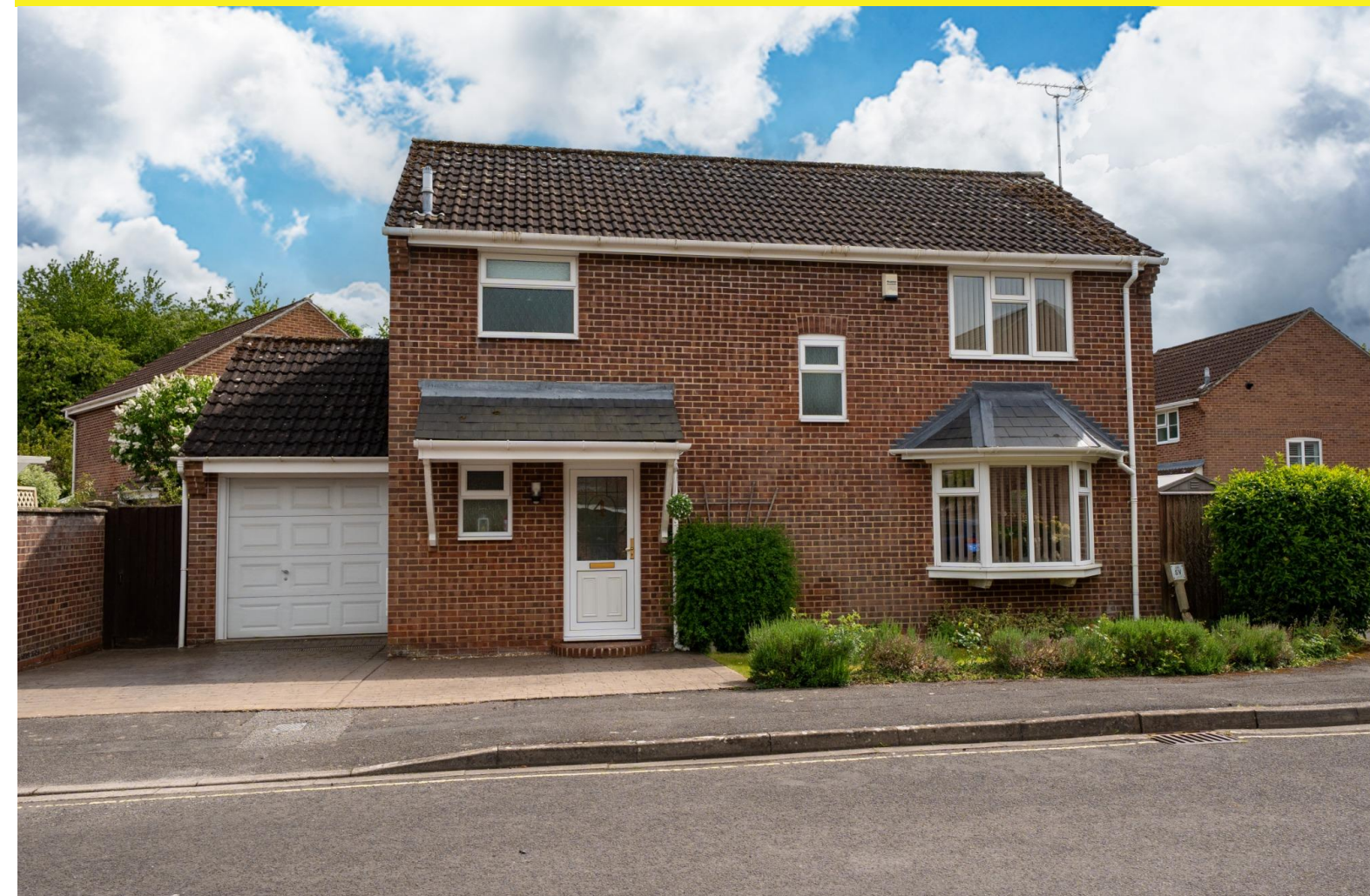
Sainsbury Close, Andover