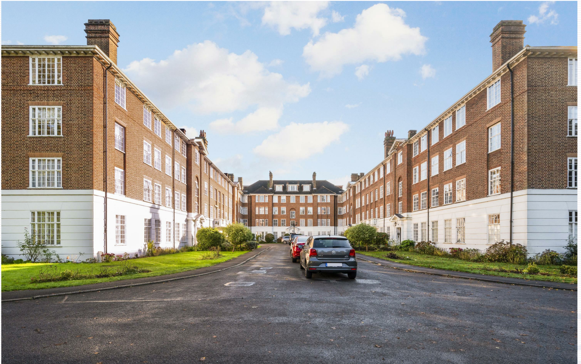
Wimbledon Park Side, Wimbledon, SW19 5NP