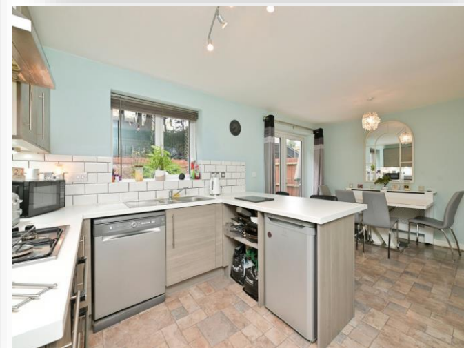
Whitney Drive, Yaxley Peterborough PE7 3EF