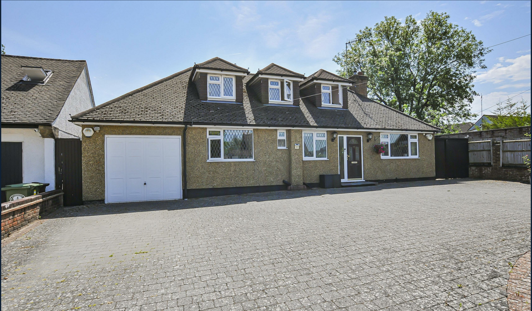
2 WOODSIDE ROAD, BRICKET WOOD, ST. ALBANS, HERTFORDSHIRE, AL2 3QL GUIDE PRICE £825,000