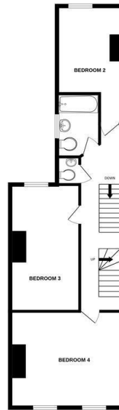
1ST FLOOR 666 sq ft. (61.8 sq.m.) approx.