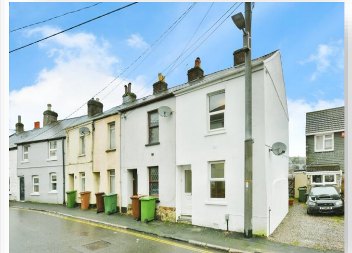
Underwood Road, Plymouth PL7 1SZ