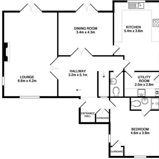
GROUND FLOOR APPROX. FLOOR AREA 104.9 SQ.M. (1129 SQ.FT.)