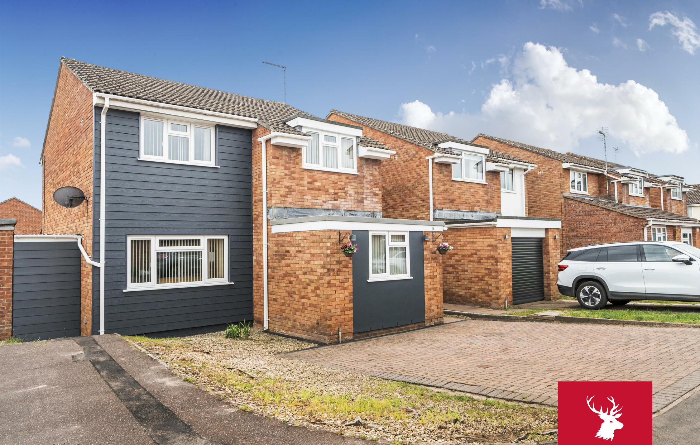
8 Bartlett Close