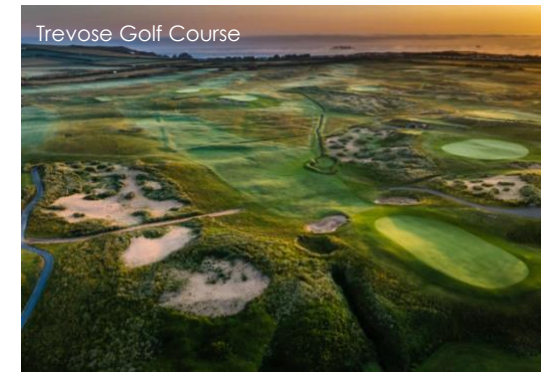
Trevoze Golf Course