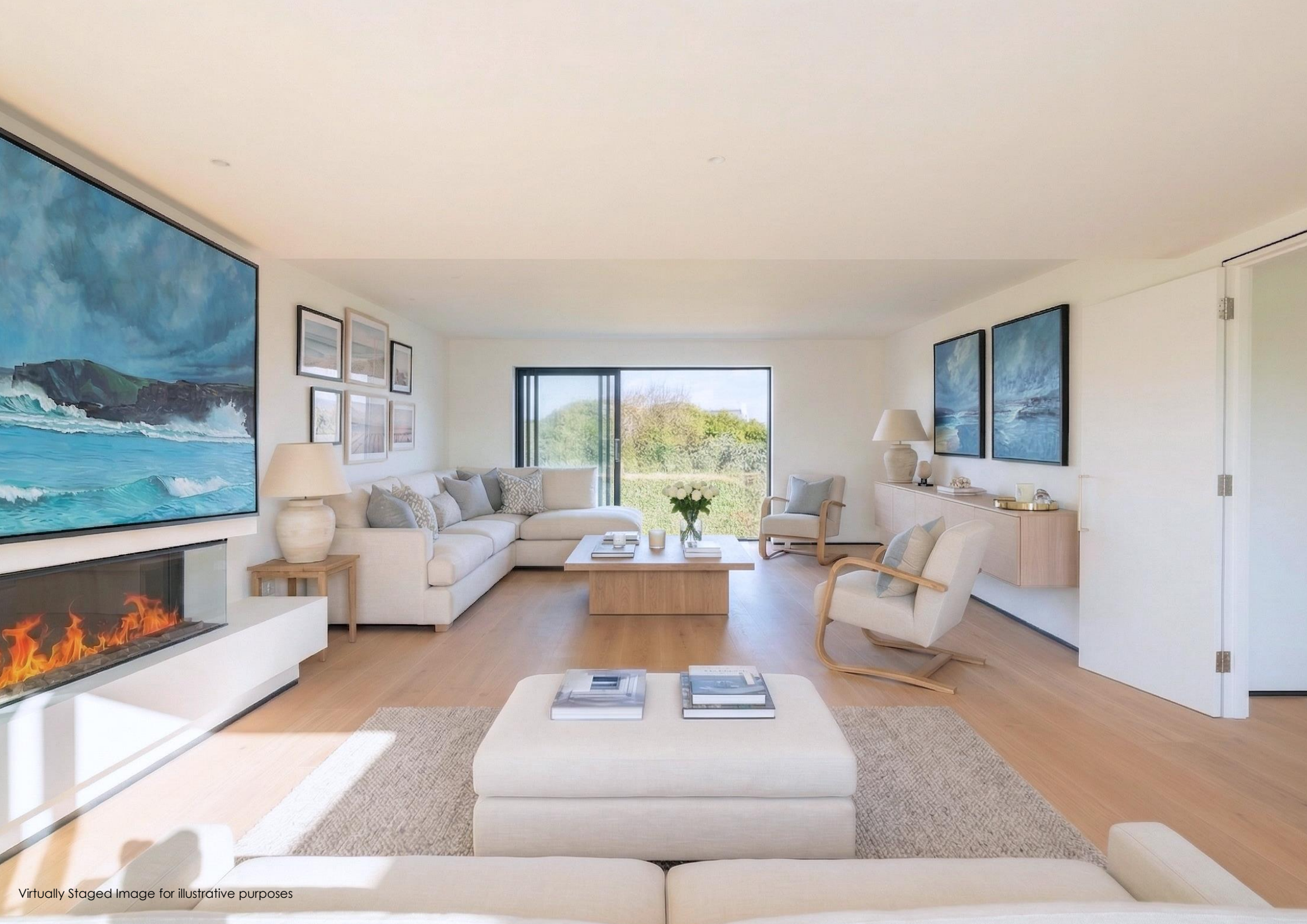
Virtually Staged Image for illustrative purposes