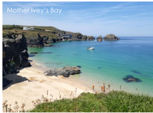
Mother Ivey's Bay