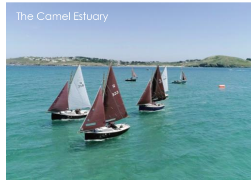
The Camel Estuary