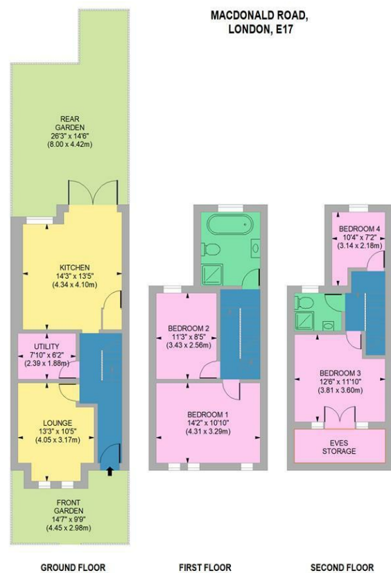
GROUND FLOOR FIRST FLOOR SECOND FLOOR

Approximate Gross Internal Floor Area Ground Floor - 546 sq.ft / 50.72 sq.m First Floor - 407 sq.ft / 37.81 sq.m Second Floor - 291 sq.ft / 27.03 sq.m Overall Internal (Excluding Eaves Storage) - 1244 sq.ft / 115.57 sq.m Eaves Storage - 57 sq.ft / 5.30 sq.m