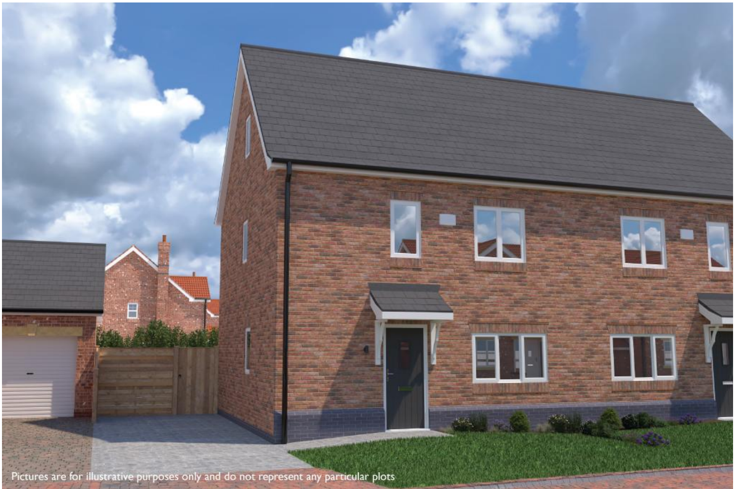
Pictures are for illustrative purposes only and do not represent any particular plots