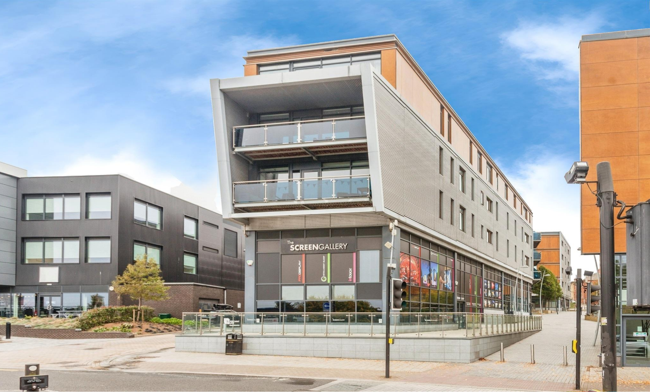
Mulberry House Burgage Square, Wakefield WF1 2SE