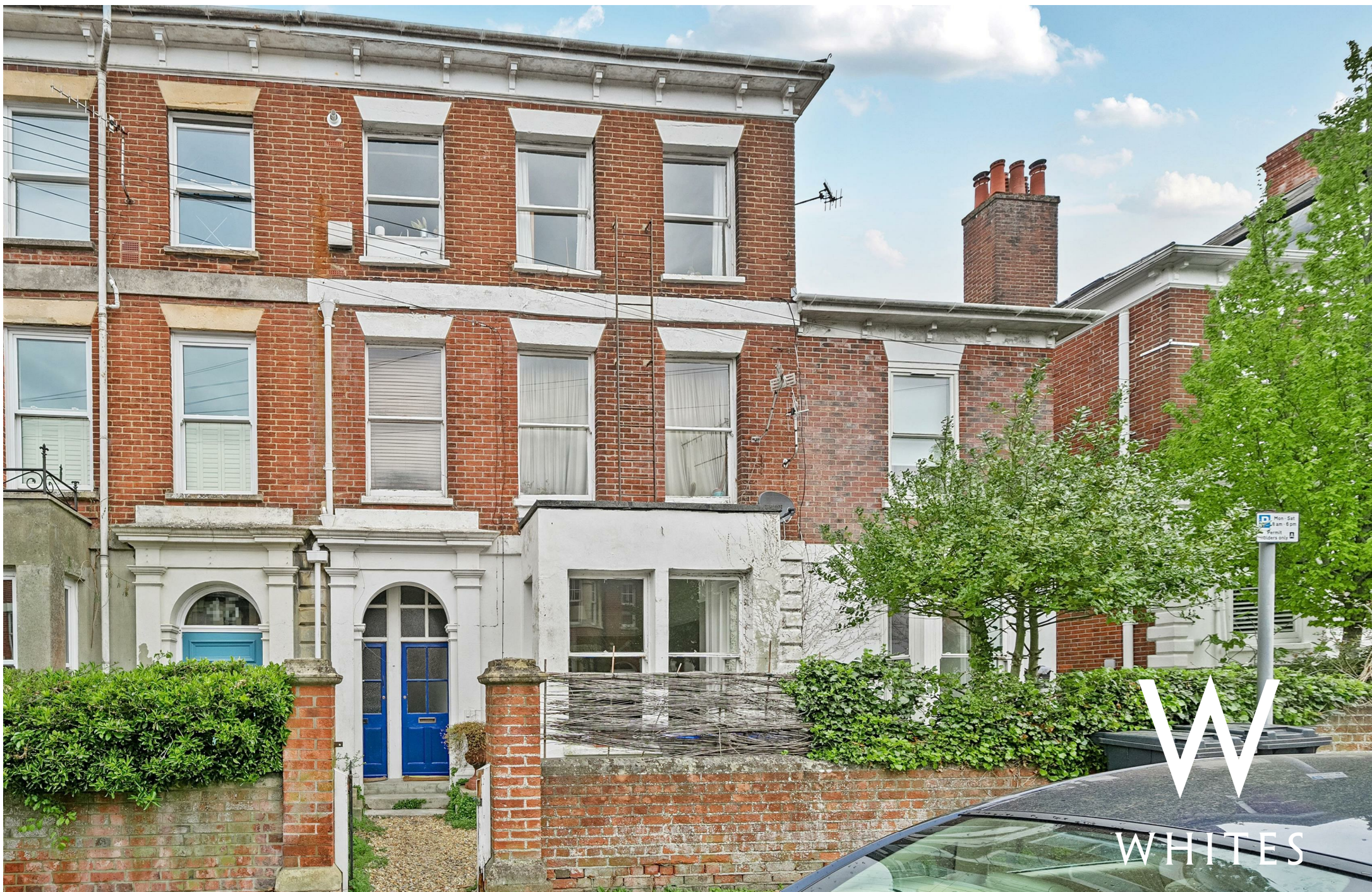
Flat 1a, 47 Wyndham Road, Salisbury, Wiltshire, SP1 3AB