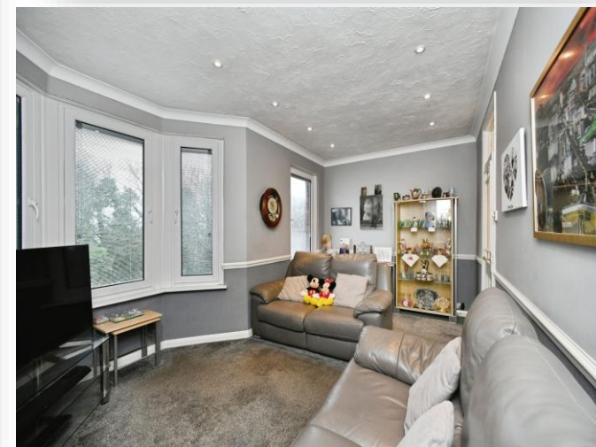
Bear Road, Brighton BN2 4DB