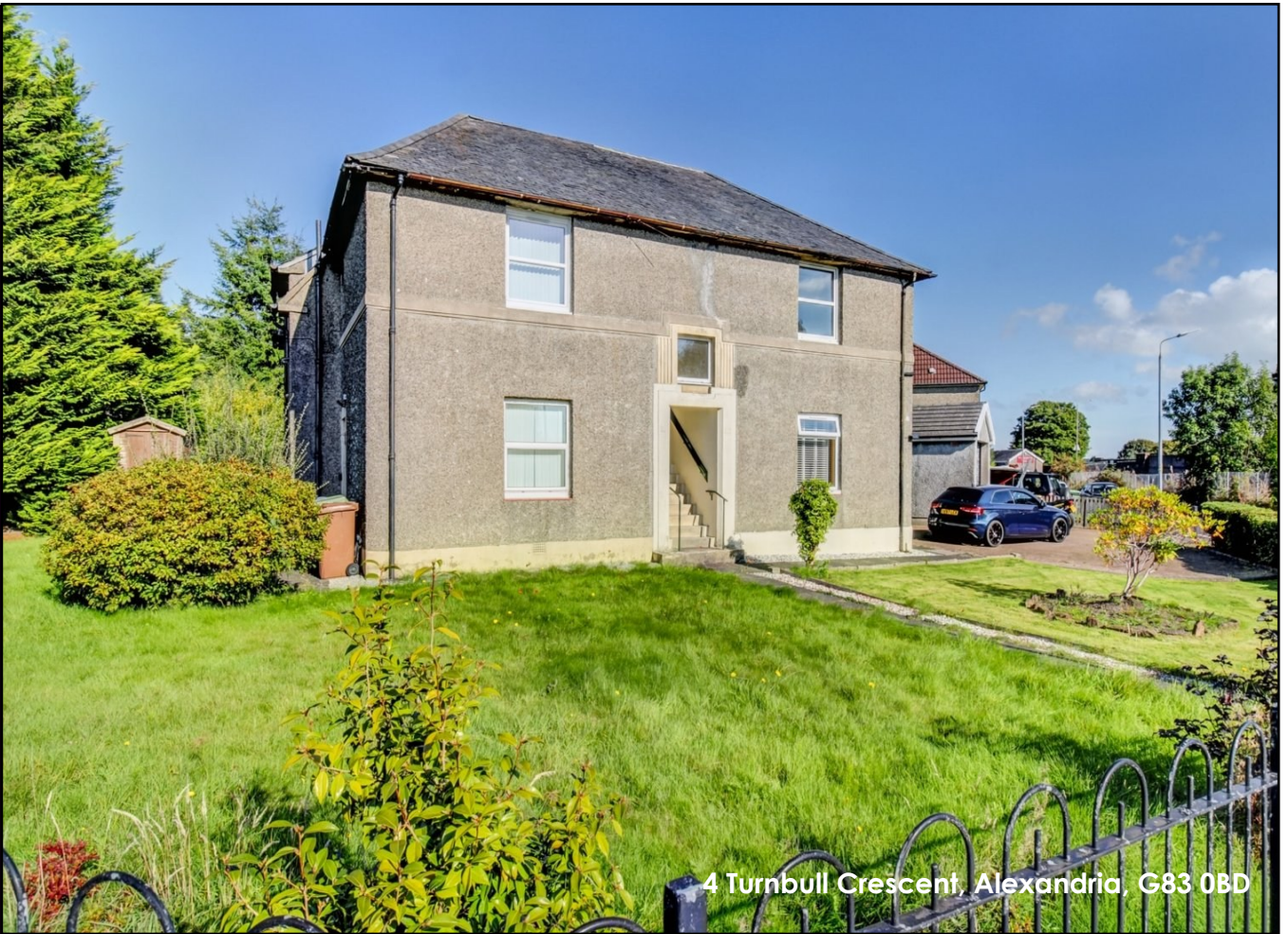
4 Turnbull Crescent, Alexandria, G83 0BD

The agent offers to the market this recently upgraded one-bedroom upper cottage flat which is conveniently located close to Alexandria town centre, which has a good range of shops and public transport links.