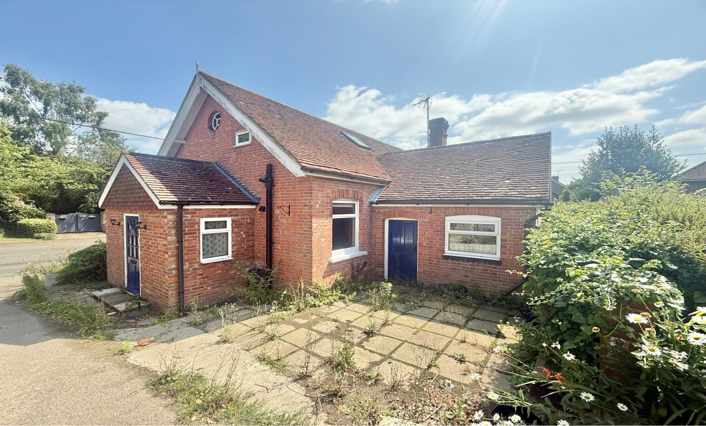
Laurel Hall - Main Street, Peasmarsh Rye TN31 6SY