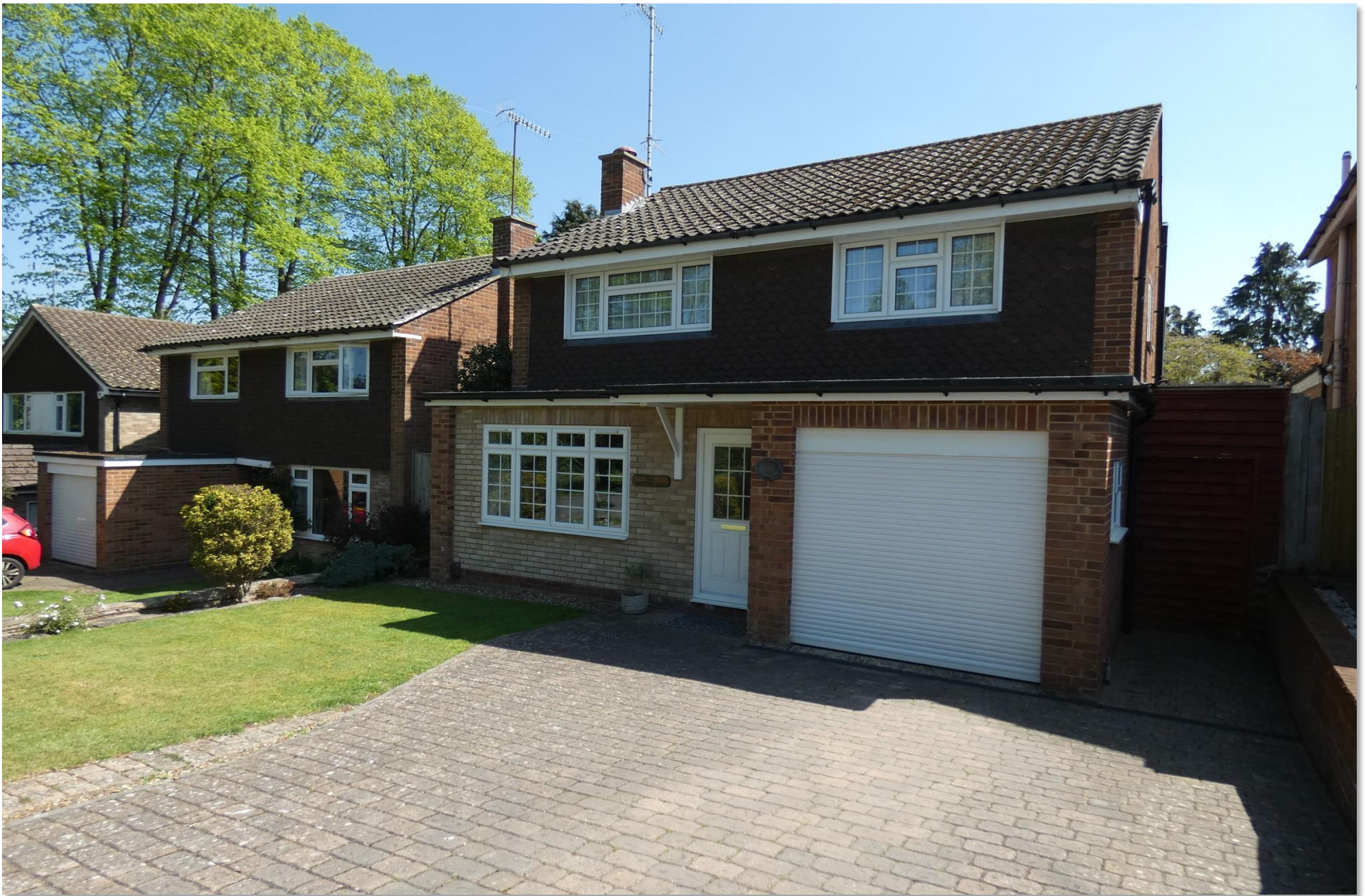
Lombardy Drive, Berkhamsted HP4 2LG