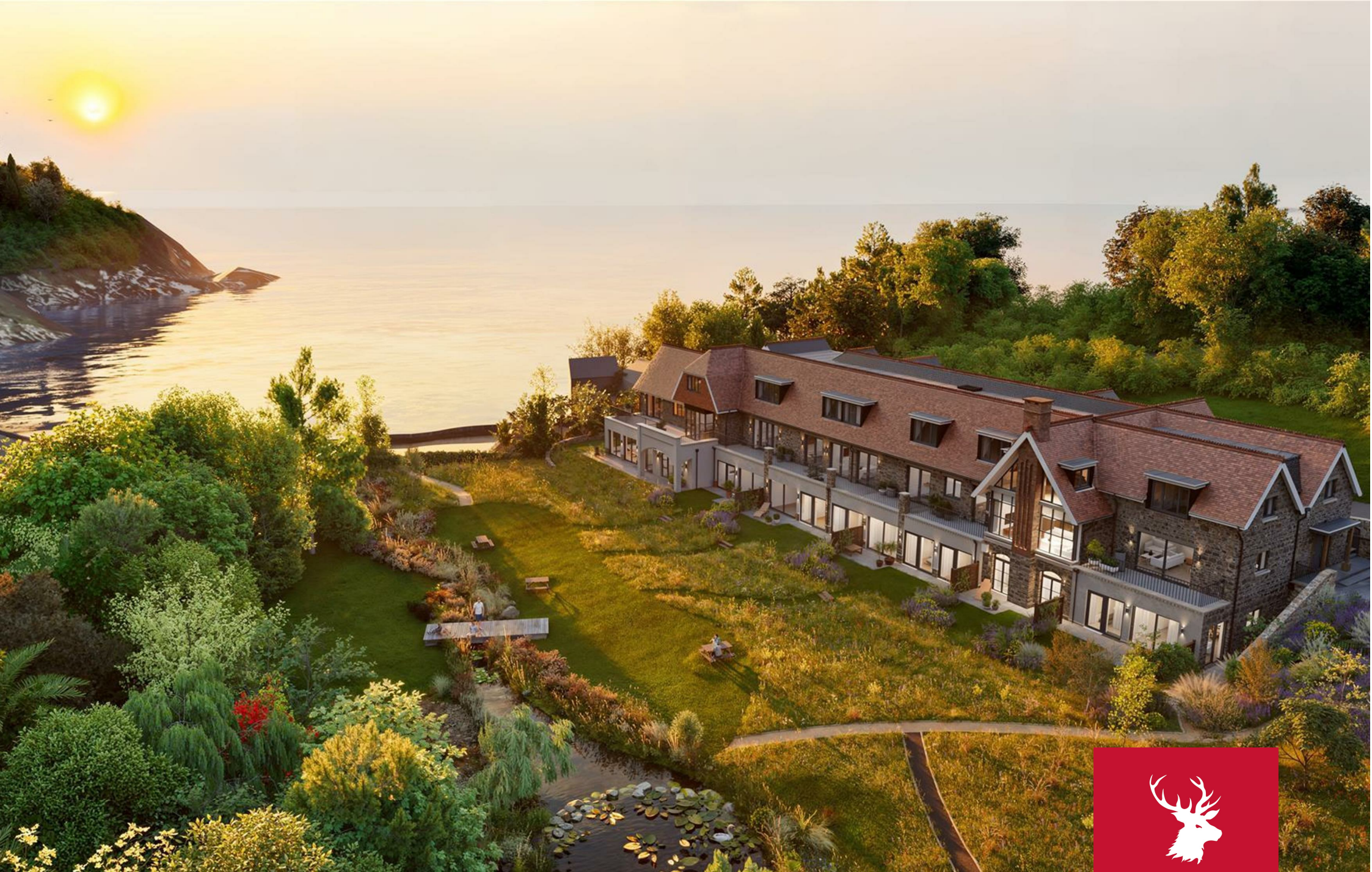
Apartment 14, Lee Bay Gardens