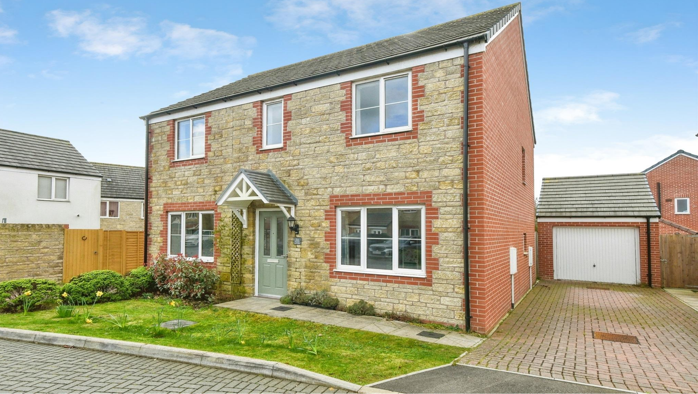
Wrag View, Highworth Swindon SN6 7QJ