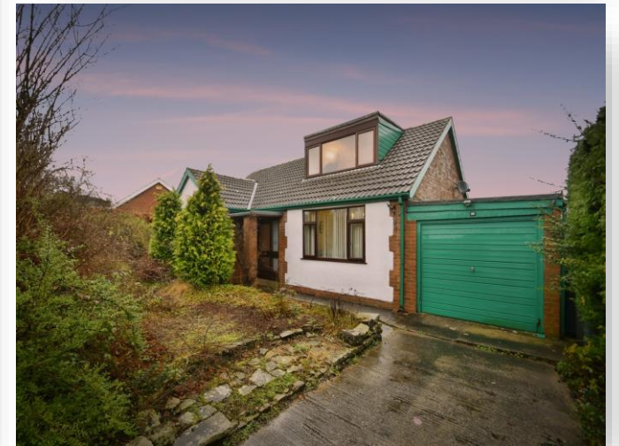
Aspin Lane, Knaresborough HG5 8HP