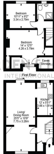
Ground Floor For Illustration Purposes Only - Not To Scale

Neville Road Approx. Total Internal Area 844 Sq Ft - 78.41 Sq M (Including Eaves Storage & Restricted Height Area) Approx. Gross Internal Area 816 Sq Ft - 75.81 Sq M (Excluding Eaves Storage & Restricted Height Area)