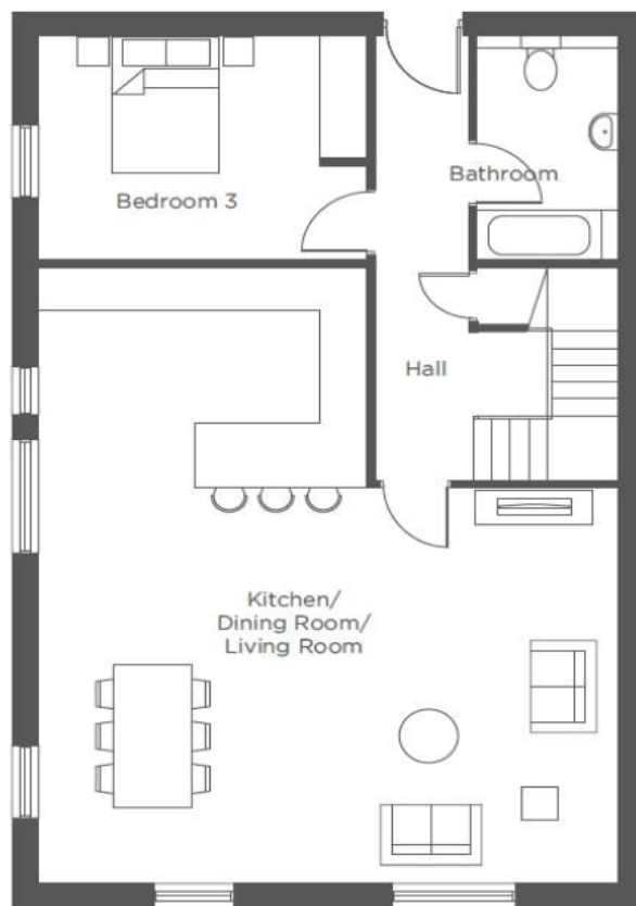
Lower level - Second Floor