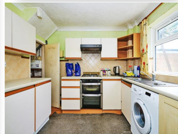
Manor Road, Stilton Peterborough PE7 3XA