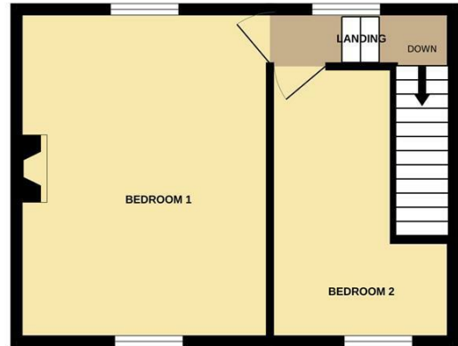
1ST FLOOR 339 sq.ft. (31.5 sq.m.) approx.